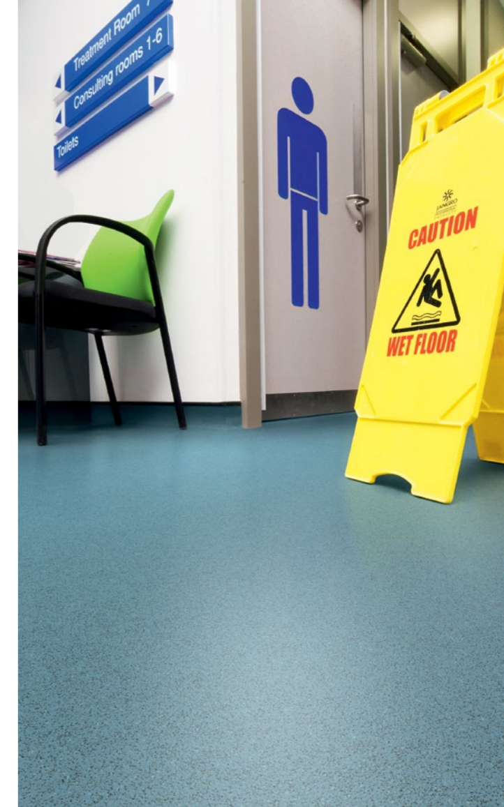
ACRE MILL HOSPITAL | UK

The Polyflor PU (polyurethane surface treatment) and PUR (polyurethane reinforcement) ranges ensure that use of polish, water, strippers and chemical cleaners are significantly reduced and thus contribute to significant maintenance cost savings for the life of the floor.