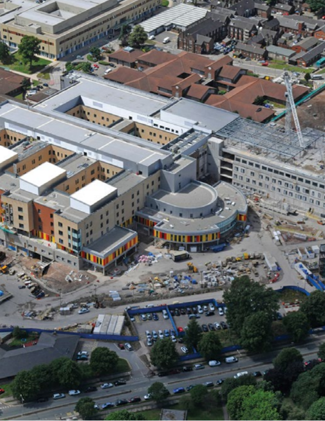
NORTH STAFFORDSHIRE HOSPITAL CONSTRUCTION